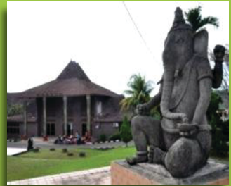
Museum Bala Putera Dewa