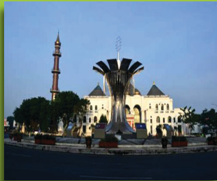
Masjid Agung & Tugu ASEAN