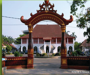
Museum Sultan Mahmud Badaruddin II