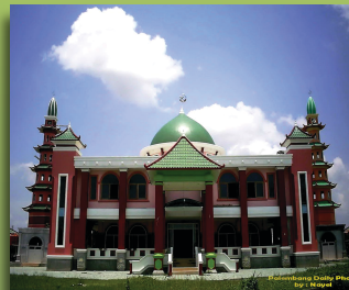
Masjid Muhammad Cheng Ho