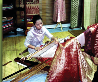
Kerajinan Tenun Songket